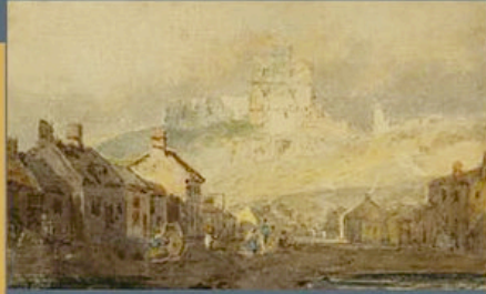
'Norham Village and Castle', J.M.W. Turner, c.1797. © Tate, London 2019.

(1) Start at the picnic table at Cow Holme. Take a moment to sit and look towards the castle. This is 'Turner's View.' Turner could walk from here, along the riverbank and up to the castle, but now, due to erosion, that is not possible.